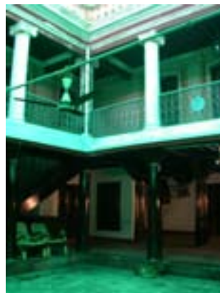
First Floor Interior - French Style