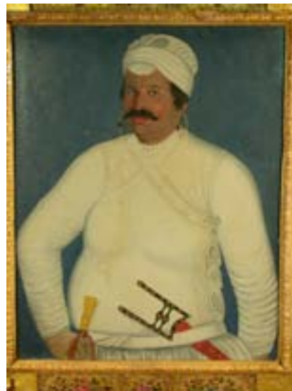
Portrait of Ananda Rangapillai dubash of Duplex

This edifice is plainly the expression of the two cultures to which the great dubash of the French governor Duplex belonged.